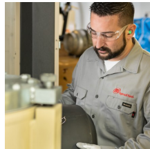
Field Overhaul Services