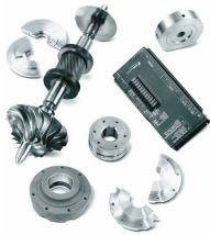
Piezas de repuesto de los compresores centrífugos de aire TURBO-AIR